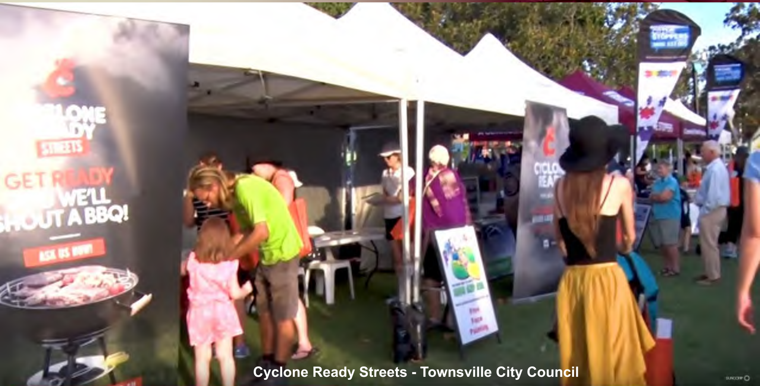
Cyclone Ready Streets - Townsville City Council