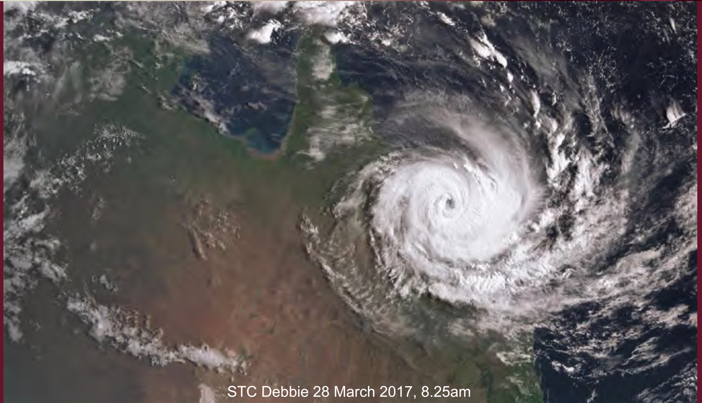
STC Debbie 28 March 2017, 8.25am